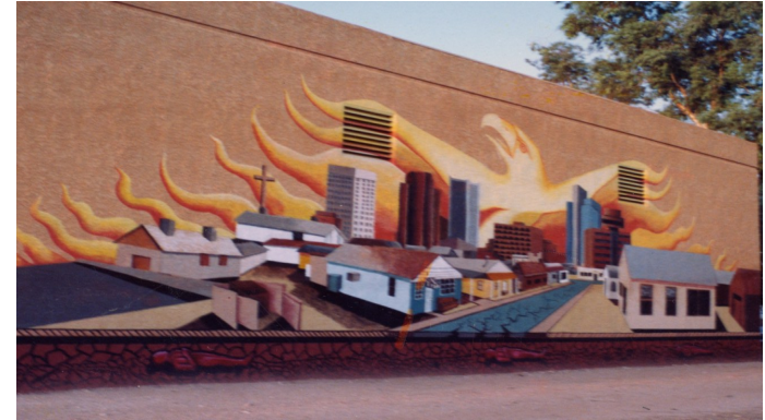
"Resurrection" (1988, south exterior gym wall)

1300 South 10th Street, Phoenix, AZ 85034